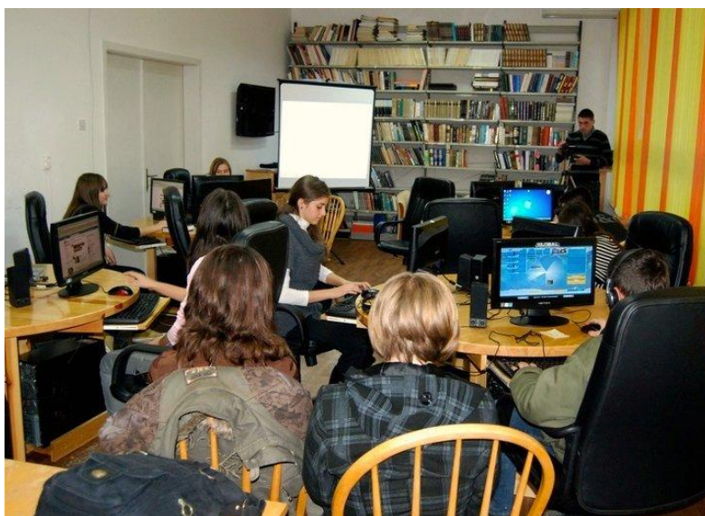
Students at the “School of Journalism” in Zavidovići Public Library, Bosnia and Herzegovina.

Partners include the Zavidovići Municipality. The Employment Agency, schools and Local Democracy Agency, all of whom were involved in marketing and promoting the project and who provided ideas and support for lectures and workshops. The Municipality also provided financial support for some activities.