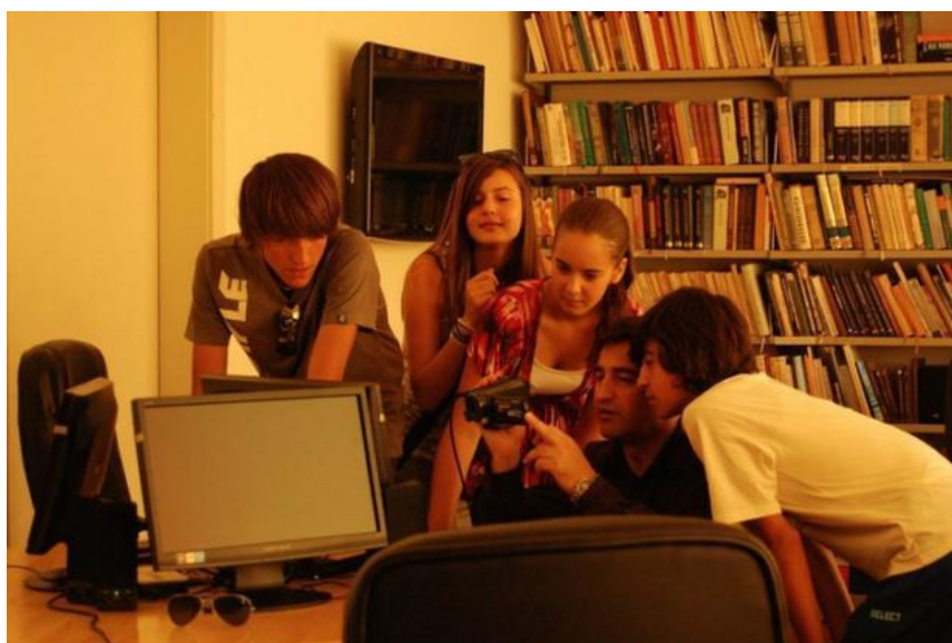
The Zavidovići Public Library has created a multi-media centre for 'the net generation'. These young people have made a film to promote their town.

To see how the Zavidovići Public Library changed its space from a traditional reading room to a space for young people, see www.youtube.com/watch?v=RAI7rCi_m-c .