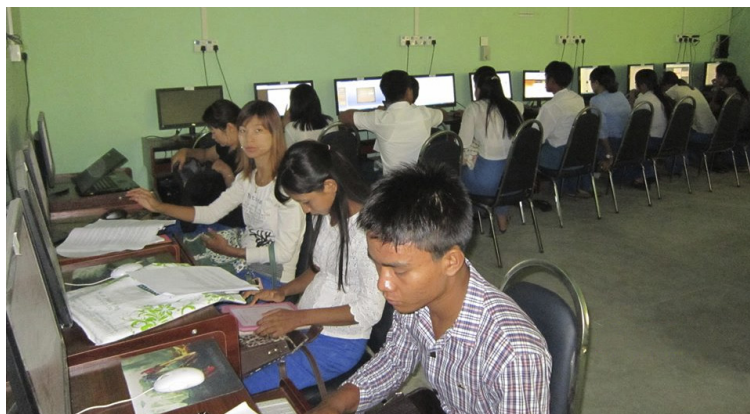
There is now rarely a spare seat in Mandalay University's new eLibrary room