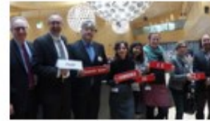
Members of the Civil Society Coalition at WIPO

Modern digital research technology, including text and data mining, is increasing demand by those who seek to study the major problems of our day, including combatting health pandemics, monitoring hate speech and disinformation on social media, and creating machine learning and “artificial intelligence” technology. These and other essential research activities are not occurring everywhere, however, because copyright law does not permit their use everywhere. To promote equity, validity, collaboration and other values in production of and access to research products and material, there is a need for a degree of harmonization in research rights between countries.