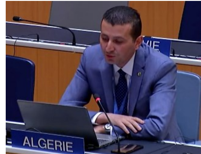
Algeria, Coordinator African Group