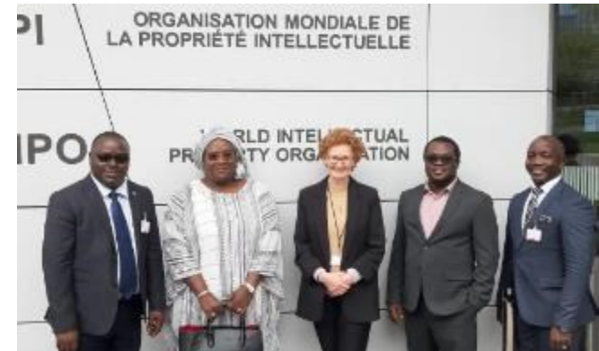
EIFL Team at SCCR/42