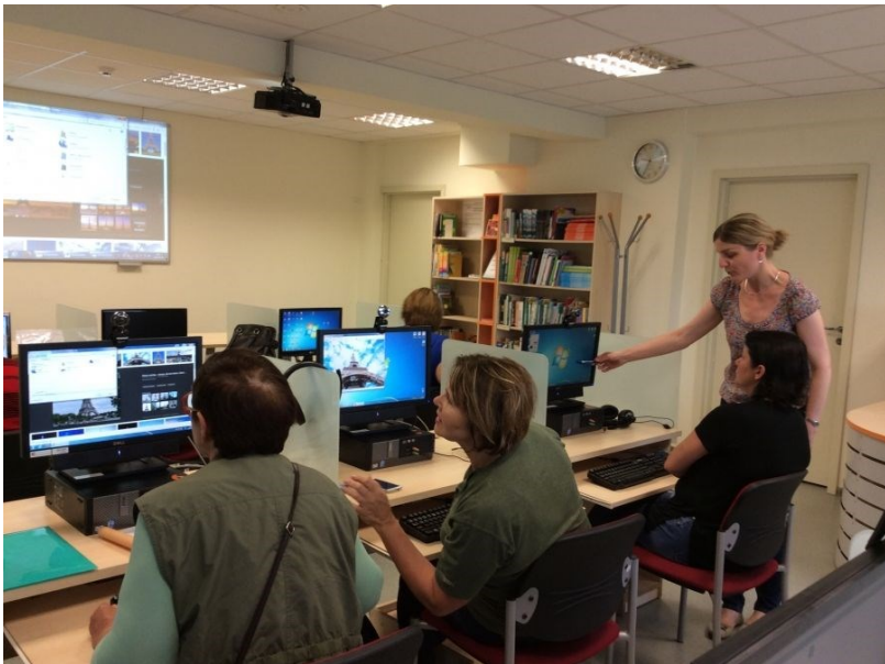
Photos from Kaunas district, Pagėgiai and Utena municipal public libraries